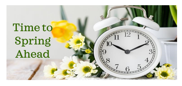
Daylight Saving Time will begin Sunday, March 9, at 2:00 A.M. Remember to set your clocks one hour ahead before you go to bed.

The Morningside Messenger 897 South Pine Street Spartanburg, SC 29302